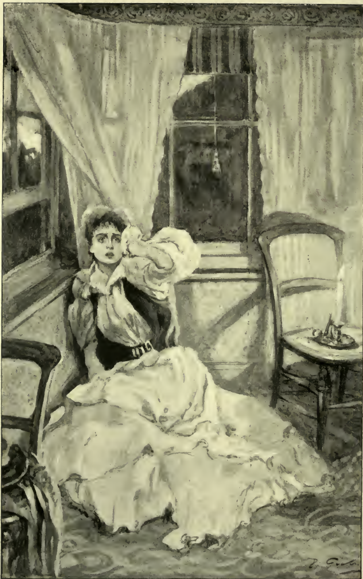
The room reeled around her.